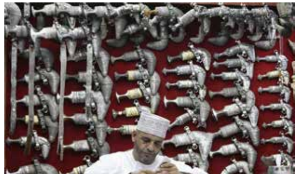
Caving, Omani Souqs (Markets)

The capital of Oman was named Ninth Best City to live and work in the world in by the Arcad is in 'Social Sustainability Index – 2016".