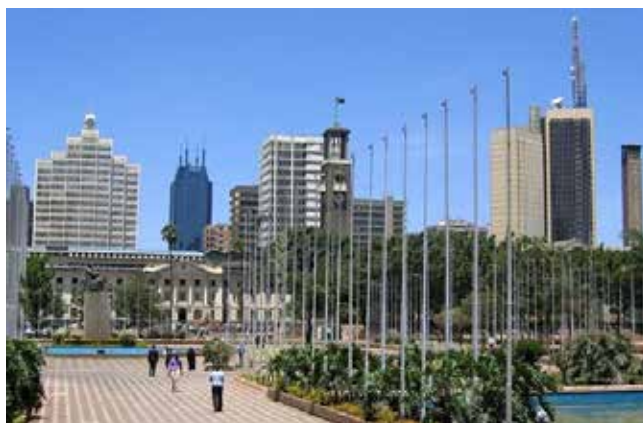
Kenya (NAIROBI) Chapter of ICAI

Ans.: The Institute provides the facility of On Line Articles Placement Portal. This portal provides a platform to the firms of Chartered Accountants having vacancies for Articled Assistants to select eligible students and the candidates who are eligible for undergoing articled training. Both eligible firms and candidates have to register themselves online through the articles placement portal. Please visit http://bosapp.icaai.org for details regarding this facility.