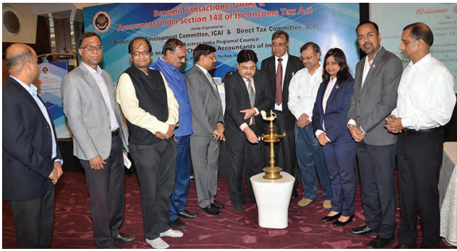
Lighting the Inauguration Lamp