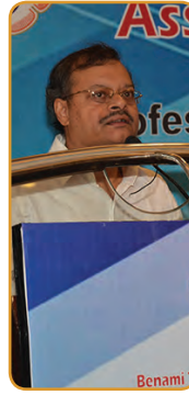
Shri P B Pramanik, Addl. Commissioner of Tax Policy Research Unit, Min. of Fin., Govt. of India