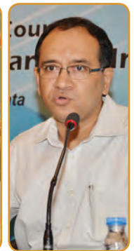
Shri Sridhar Bhattacharyya, IRS, Addl. Commissioner of Income Tax (BPU)