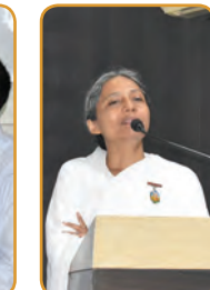
Teachers from Brahma Kumaris